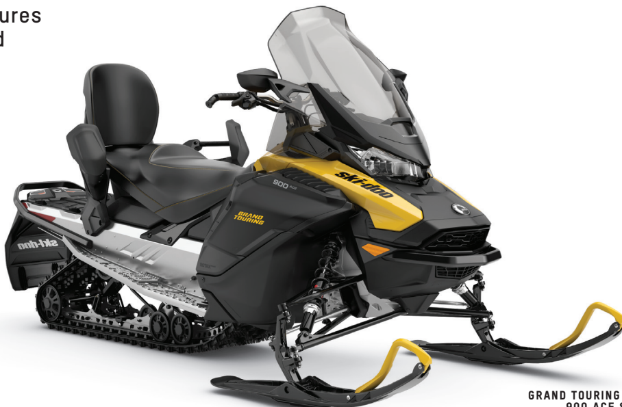
GRAND TOURING SPORT 900 ACE SHOWN

Trail comfort and 2-up features with precision handling and savvy style.