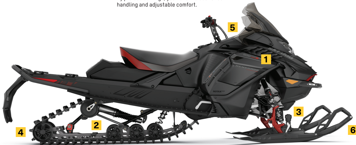
RENEGADE ADRENALINE WITH ENDURO PACKAGE 900 ACE TURBO R SHOWN

Flatter cornering and precision handling in all conditions. Developed in tandem with the rMotion X rear suspension to raise the bar in trail snowmobile chassis performance. Wider, adjustable ski stance and +1.0 mm of suspension stroke maximize stability, capability and comfort.