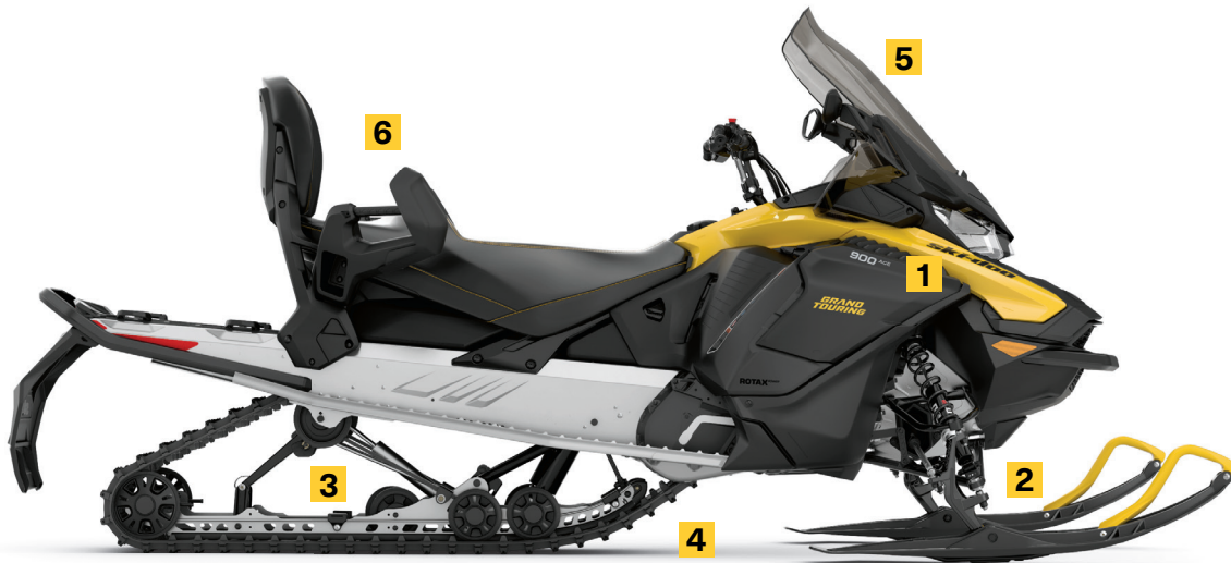
GRAND TOURING SPORT 900 ACE SHOWN

High-quality KYB 1 high-pressure gas shock for excellent performance and reliability.