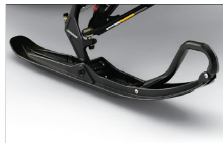
Pilot™ 5.7 skis Deliver outstanding grip and bite in corners with virtually no darting.