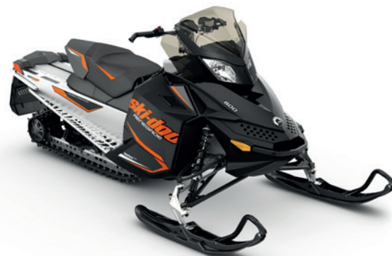
RENEGADE ® SPORT 600 Carb shown