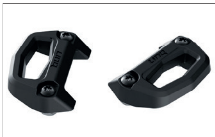
LinQ™ cargo system (option) Our cargo attachment system is the hassle-free way to connect cargo bags or a fuel caddy to your sled in seconds.