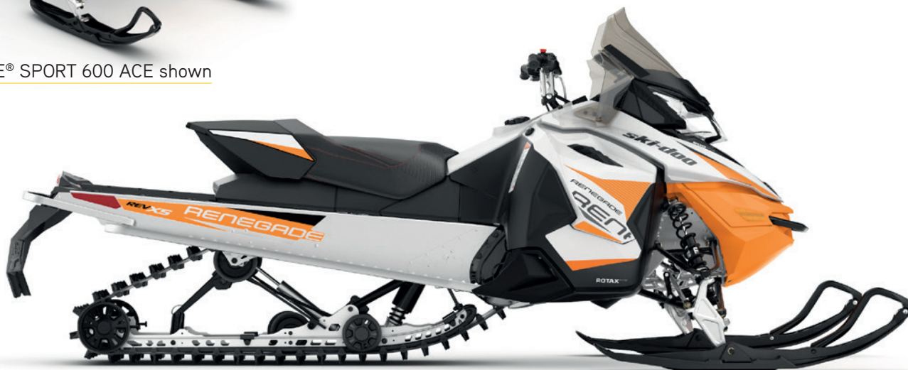
RENEGADE® SPORT 600 ACE shown