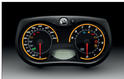
Analog gauge with display