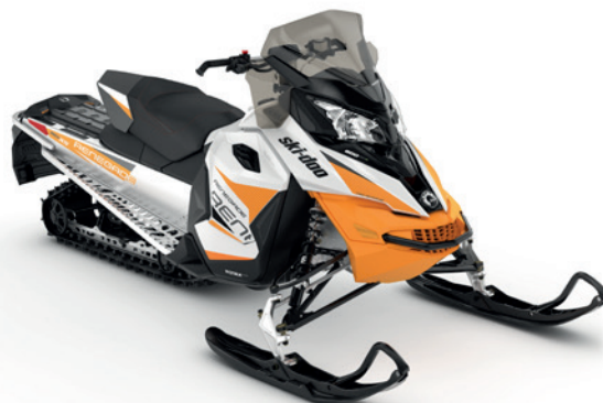
RENEGADE ® SPORT 600 ACE shown