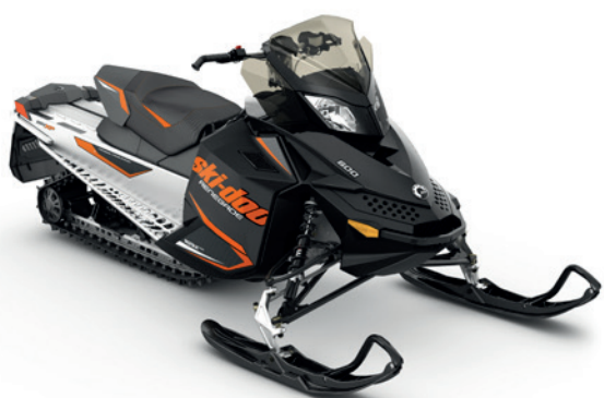
RENEGADE® SPORT 600 Carb shown