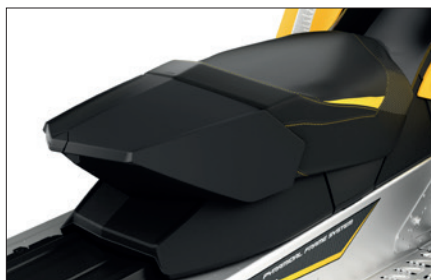
Comfortable REV-XP™ seat Sleek, yet comfortable. Includes trunk with 7 L (1.9 US gal).