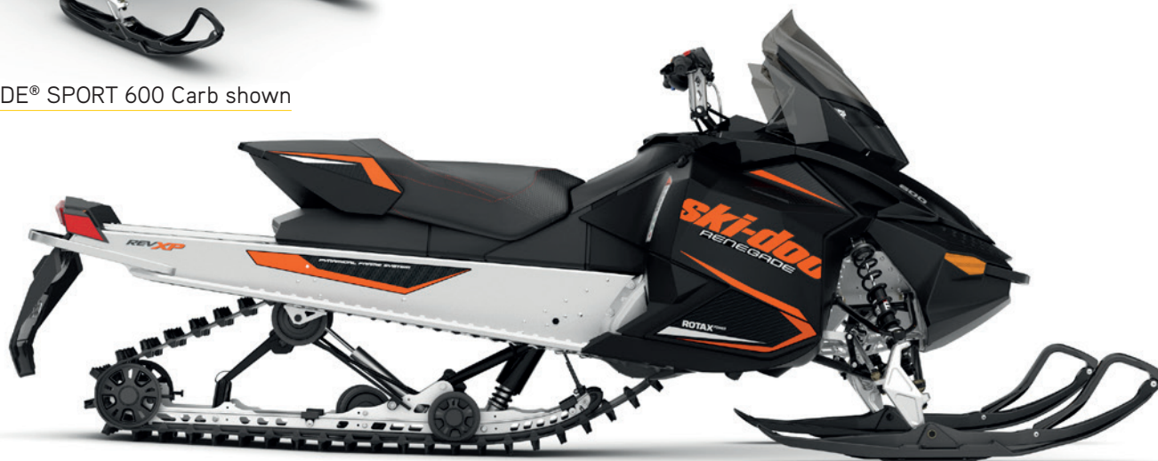
RENEGADE® SPORT 600 Carb shown