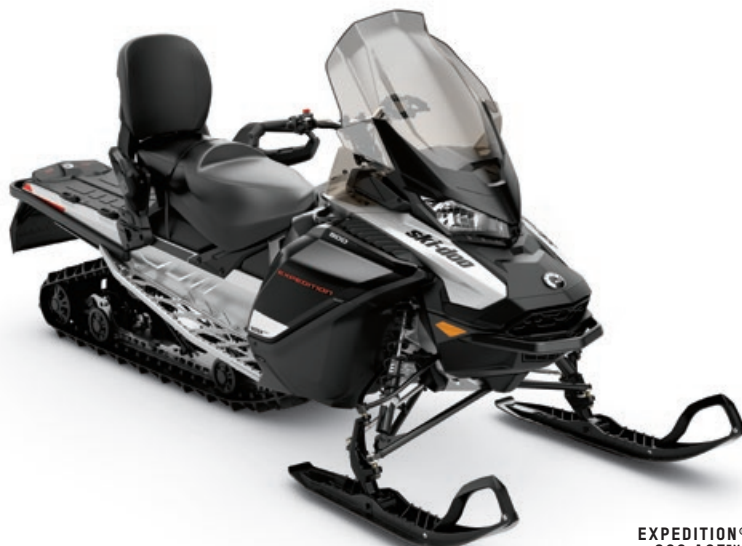
EXPEDITION® SPORT 900 ACE™ SHOWN

Ultra-responsive chassis for on- or off-trail rides and extensive array of sport-utility and 2-up features.