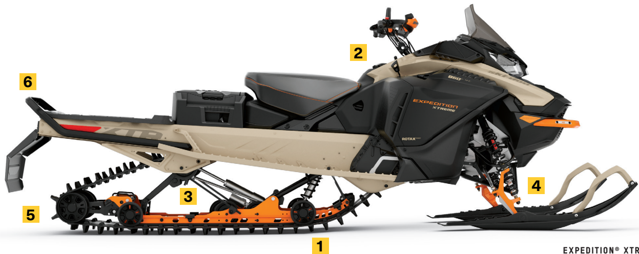
EXPEDITION® XTREME™ 850 E-TEC® SHOWN

Extreme-capability, extreme-durability shocks with compression adjustment for optimized control in the toughest conditions. Lightweight aluminum and rebuildable/revalvable.