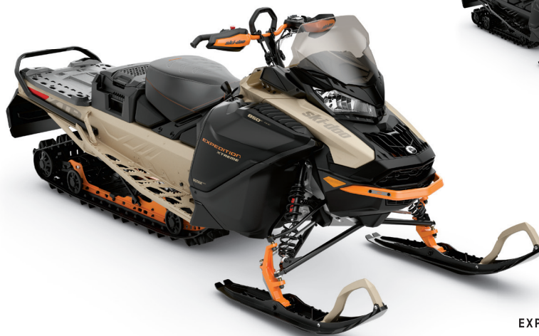
EXPEDITION® XTREME™ 850 E-TEC® SHOWN

The high-performance sport-utility sled with capability to go just about anywhere.