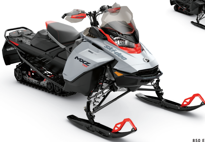
MXZ® TNT® 850 E-TEC® SHOWN

Advancing its legacy as a favorite of aggressive trail riders.