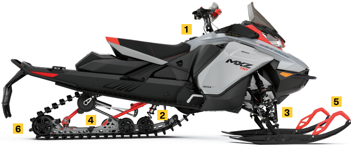
MXZ® TNT® 850 E-TEC® SHOWN

Flatter cornering and precision handling in all conditions. Developed in tandem with the rMotion X rear suspension to raise the bar in trail snowmobile chassis performance. Wider, adjustable ski stance and +1.0 mm of suspension stroke maximize stability, capability and comfort.