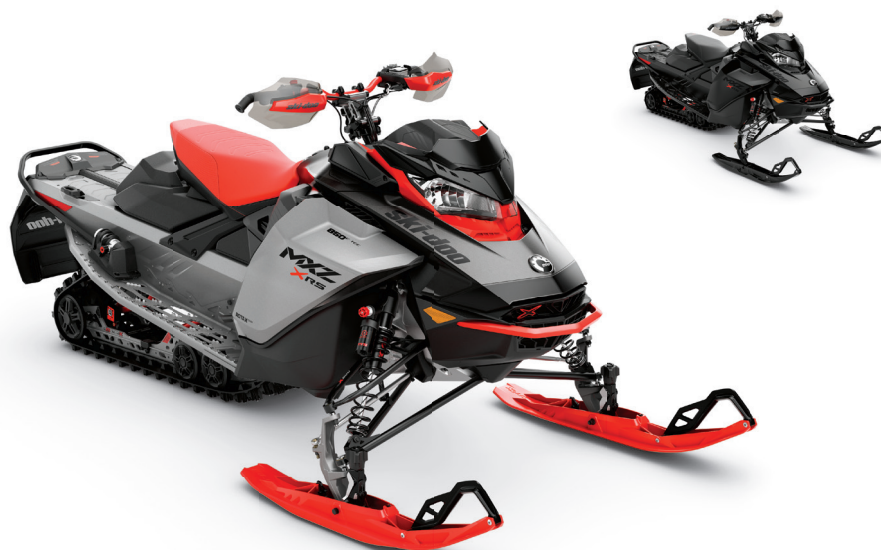
MXZ® X-RS® 850 E-TEC® SHOWN

A non-compromising race-inspired sled capable of taking on the roughest trails with ease.