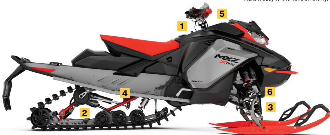
MXZ® X-RS® 850 E-TEC® SHOWN

Industry-first, innovative semi-active KYB shock technology provides the ultimate suspension performance available in snowmobiles. The system constantly reads engine parameters and chassis inputs, including steering, to adjust damping of shocks as needed to deliver anti-bottoming, lateral stability and forward and aft pitch control. Comfort, Sport and Sport + modes make it easy to fine-tune on the fly.