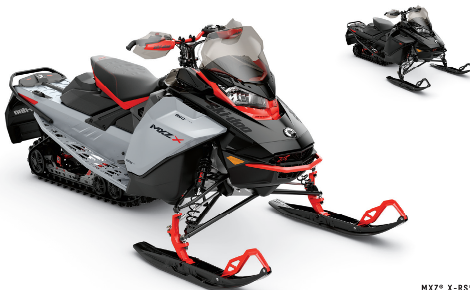
MXZ® X-RS® 850 E-TEC® SHOWN

High-tech features and racing DNA for hard-core trail riders.