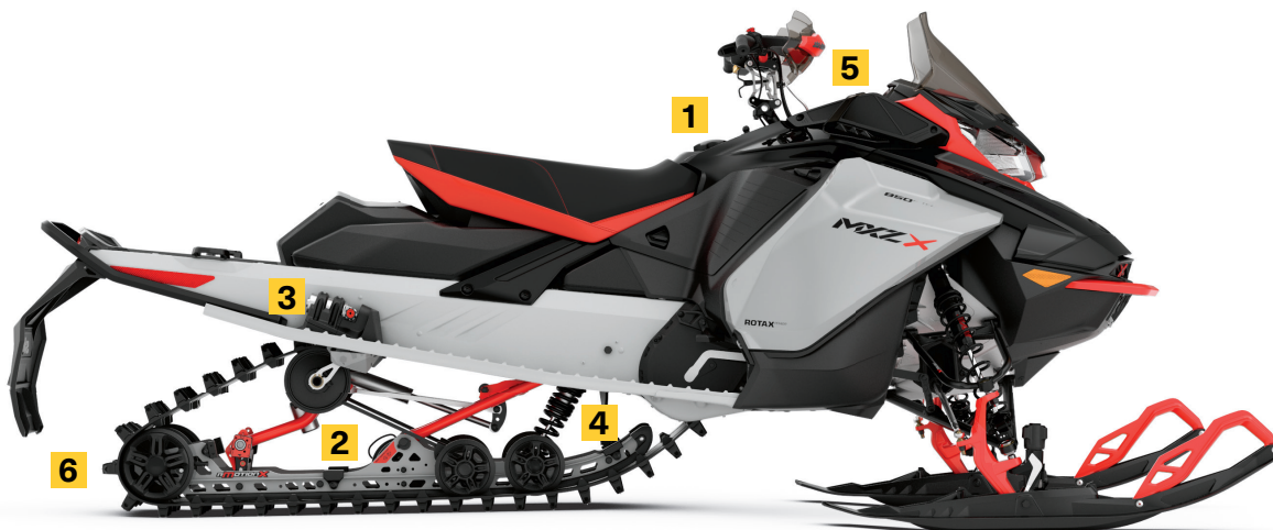
MXZ® X® 850 E-TEC® SHOWN

Totally transforms the handling characteristics of the sled according to riding style or conditions with unmatched ease. Includes rMotion X Quick Adjust System and Pilot TX skis.