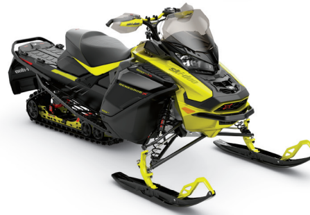
RENEGADE® X® 850 E-TEC® SHOWN