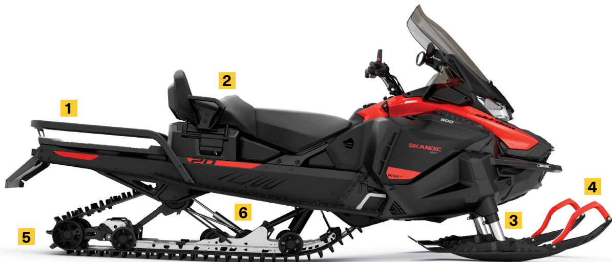
SKANDIC® SWT 900 ACE™ SHOWN

Industry-exclusive telescopic front suspension enables a large, flat belly pan for exceptional deep-snow flotation.