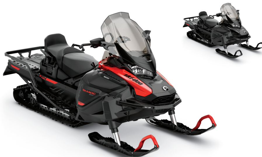
SKANDIC® SWT 900 ACE™ SHOWN

Optimal off-trail traction and flotation with the widest track in the industry.