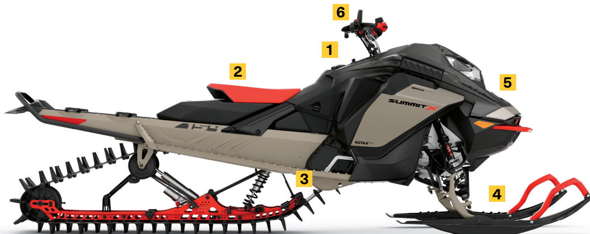
SUMMIT® X® WITH EXPERT PACKAGE 154 850 E-TEC® TURBO SHOWN

Quickly and easily change the limiter strap length for the desired ski lift without crawling under the sled.