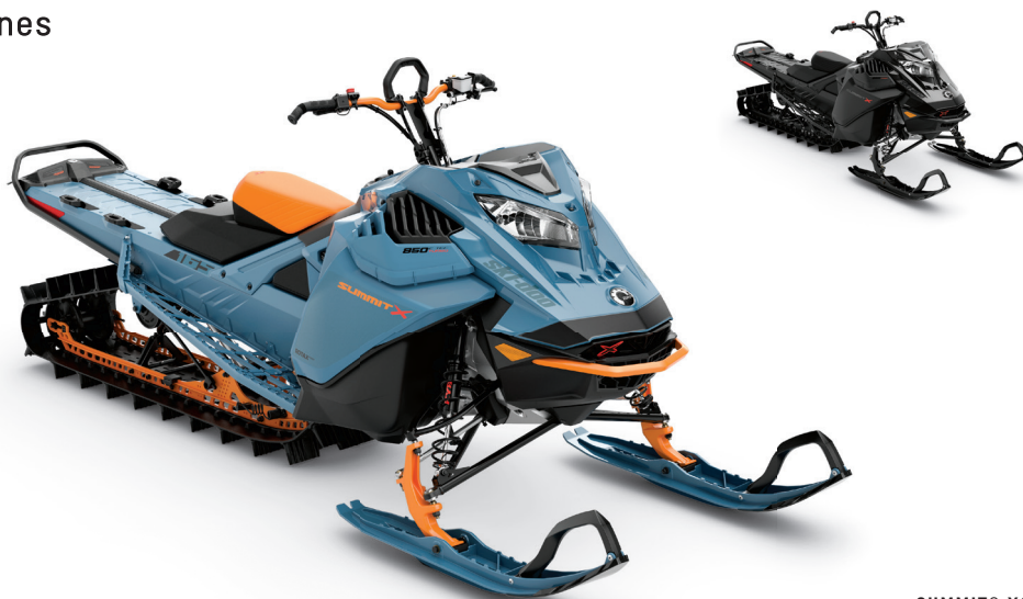
SUMMIT® X® 165 850 E-TEC® TURBO SHOWN

Longer climbs, tighter tree lines and deeper powder.