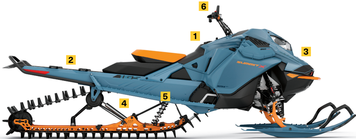
SUMMIT® X® 165 850 E-TEC® TURBO SHOWN

One-piece polypropylene construction instantly drops 6.2 lb of weight. Optimized ventilation for heat dispersion and noise reduction.