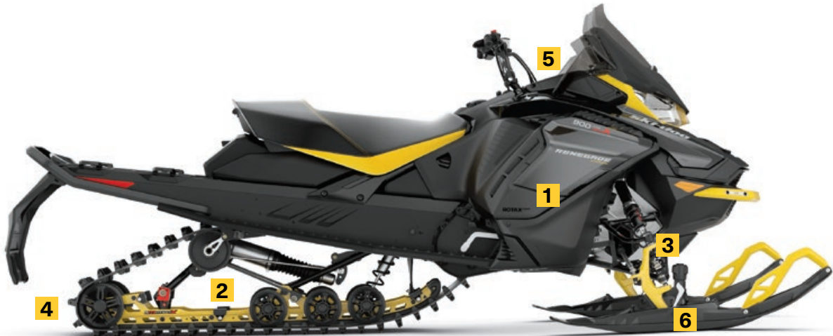
RENEGADE ENDURO 900 ACE TURBO SHOWN

Flatter cornering and precision handling in all conditions. Developed in tandem with the rMotion X rear suspension to raise the bar in trail snowmobile chassis performance. Wider, adjustable ski stance and +1.0 mm of suspension stroke maximize stability, capability and comfort.