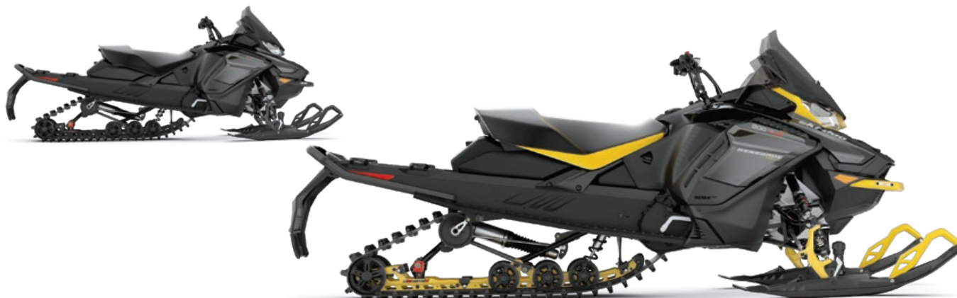
RENEGADE ENDURO 900 ACE TURBO SHOWN

Adventure-ready with top-tier technology, comfort and performance.