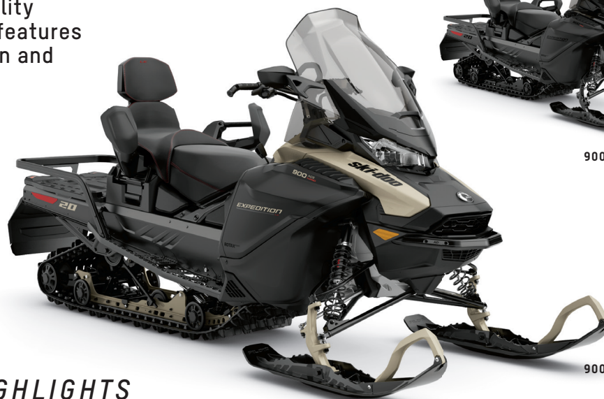
EXPEDITION LE 900 ACE TURBO SHOWN

A hybrid crossover-utility vehicle with premium features for off-trail exploration and on-trail cruises.