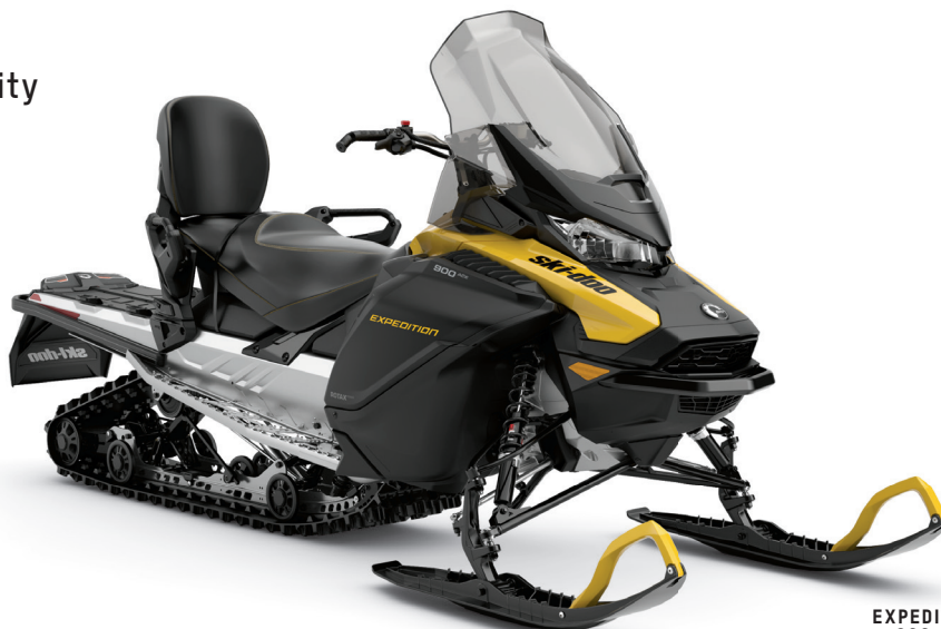
EXPEDITION SPORT 900 ACE SHOWN

Ultra-responsive chassis for on- or off-trail rides and extensive array of sport-utility and 2-up features.