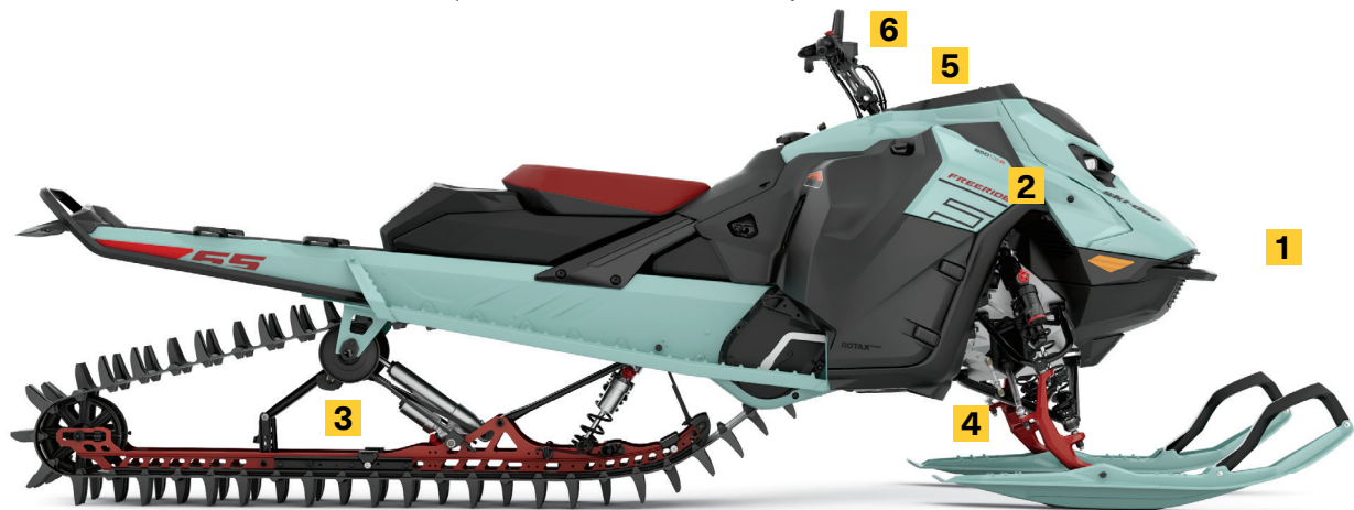
FREERIDE 165 850 E-TEC TURBO R SHOWN

In addition to 3 lb of weight savings and increased capacity, the tMotion XT dons a locked rear arm for more rigidity in technical maneuvers.