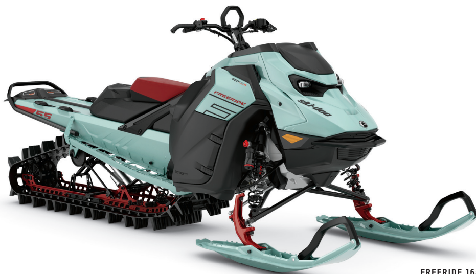
FREERIDE 165 850 E-TEC TURBO R SHOWN