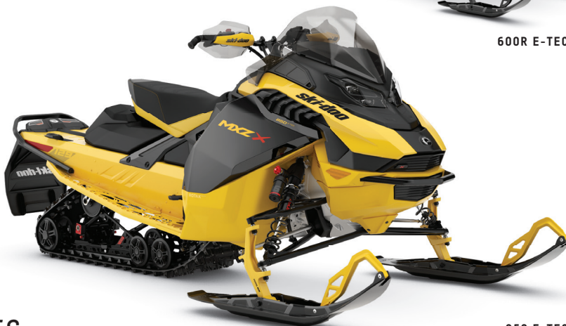
MXZ X 850 E-TEC SHOWN