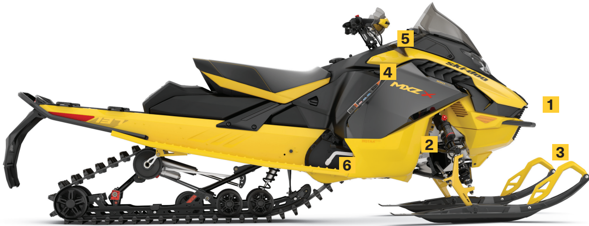
MXZ X 850 E-TEC SHOWN

The aggressive design of the Pilot RX ski offers better grip, enhanced cornering, and unparalleled control in all snow conditions.