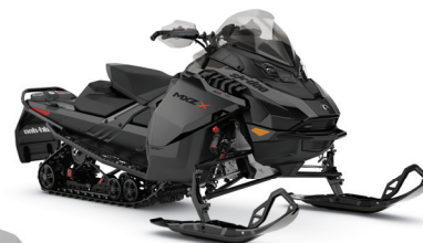
MXZ X 600R E-TEC SHOWN

High-performance with race-ready features for the most demanding rider.