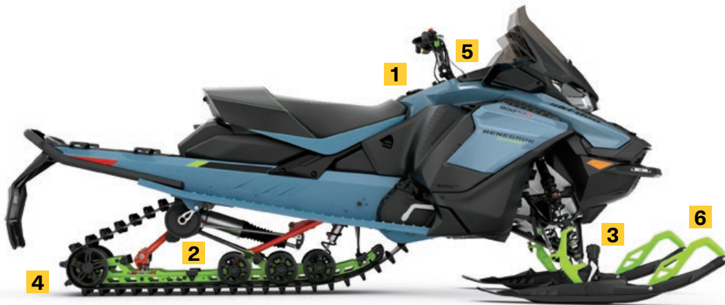
RENEGADE® ENDURO™ 900 ACE™ TURBO R SHOWN

Flatter cornering and precision handling in all conditions. Developed in tandem with the rMotion X rear suspension to raise the bar in trail snowmobile chassis performance. Wider, adjustable ski stance and +1.0 mm of suspension stroke maximize stability, capability and comfort.