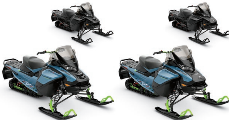
RENEGADE® ENDURO™ 900 ACE™ TURBO R SHOWN