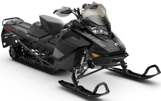
BACKCOUNTRY™ 600R E-TEC® shown