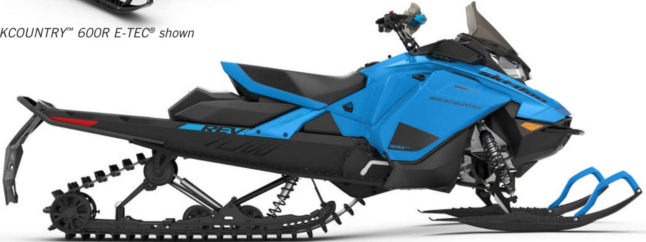
BACKCOUNTRY™ 850 E-TEC® shown