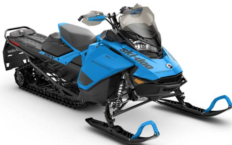
BACKCOUNTRY™ 850 E-TEC® shown