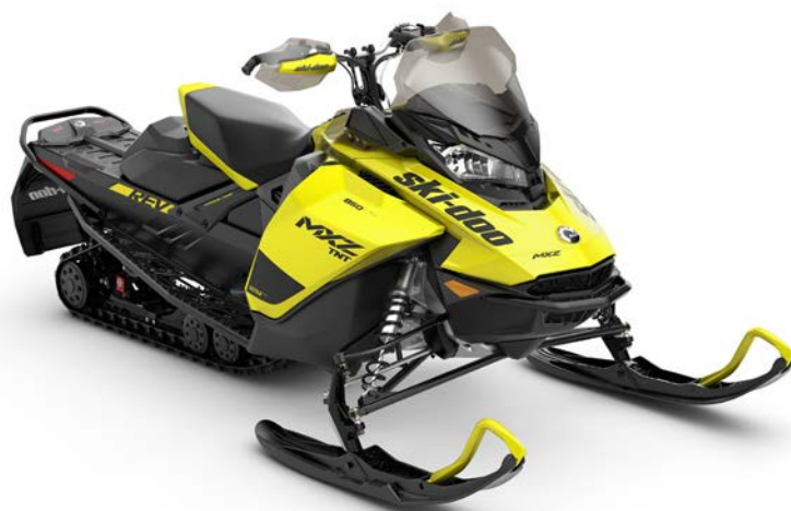
MXZ® TNT® 850 E-TEC® shown