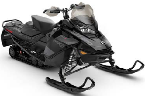
MXZ® TNT® 600R E-TEC® shown