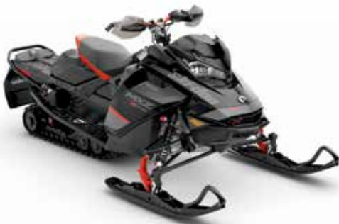
MXZ® X-RS® 600R E-TEC® shown