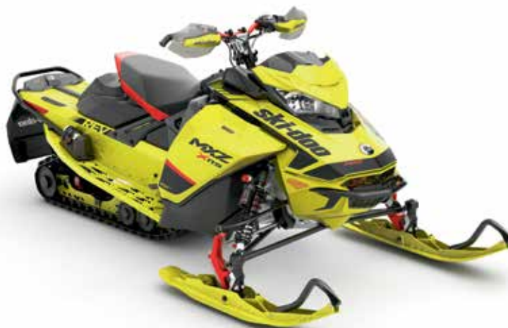
MXZ® X-RS® 850 E-TEC® shown