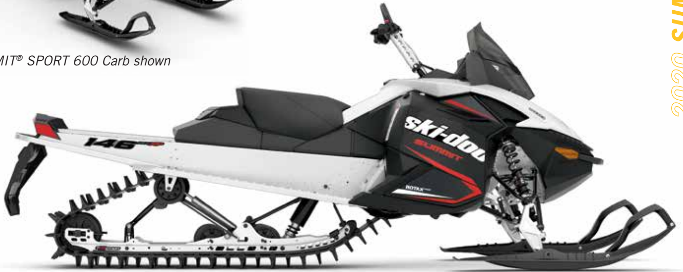
SUMMIT® SPORT 600 Carb shown