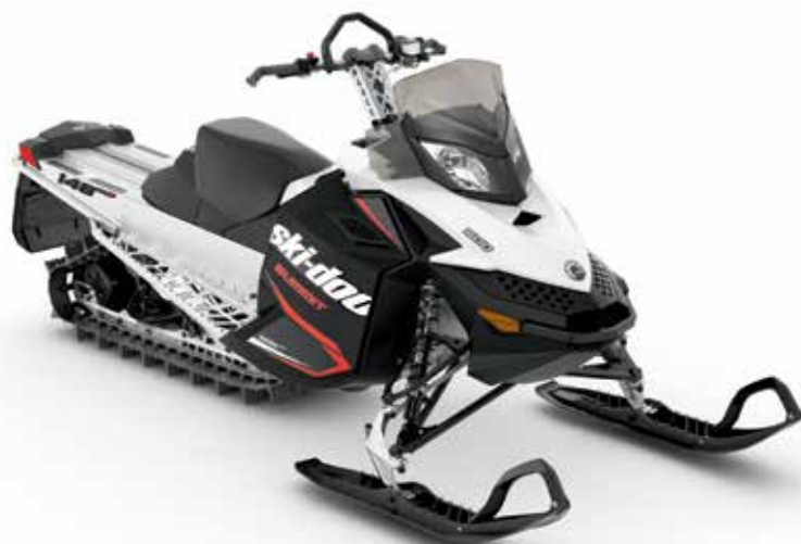
SUMMIT® SPORT 600 Carb shown