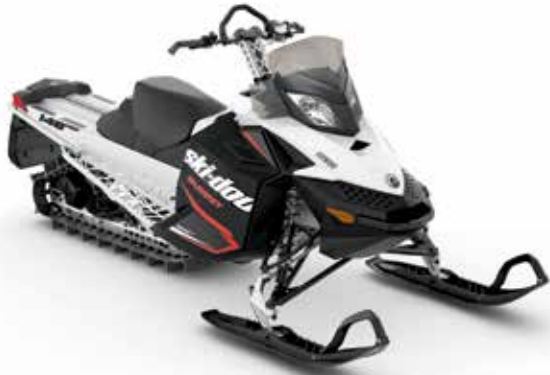
SUMMIT® SPORT 600 Carb shown