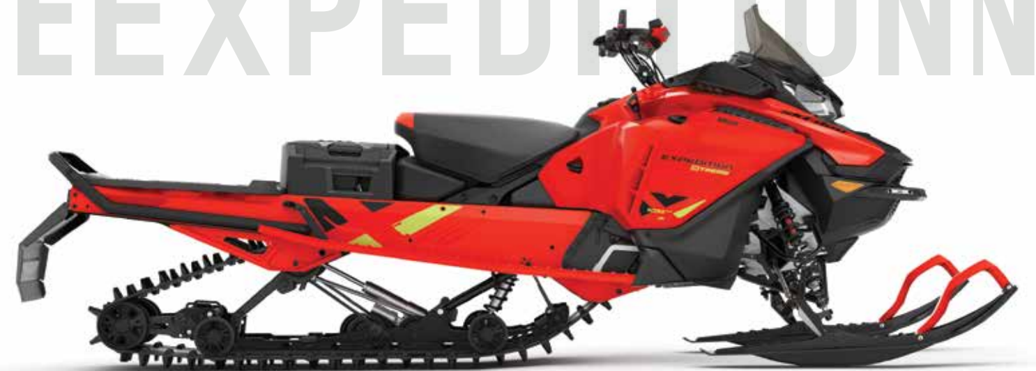
EXPEDITION® XTREME 850 E-TEC SHOWN