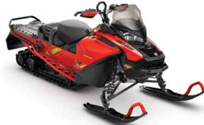
EXPEDITION® XTREME 850 E-TEC SHOWN