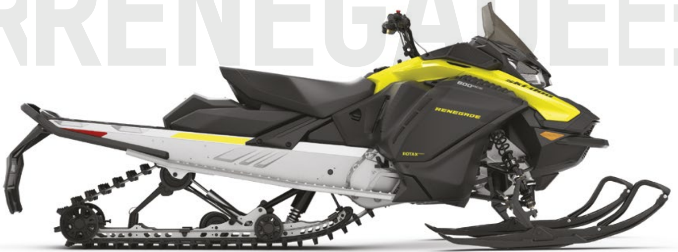
RENEGADE® SPORT 600 ACE™ SHOWN