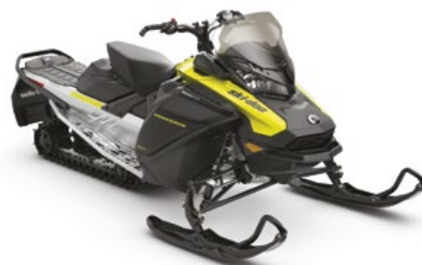
RENEGADE® SPORT 600 ACE™ SHOWN