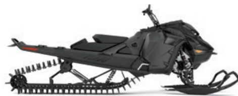
SUMMIT EDGE 165 850 E-TEC SHOWN

This high-end in-season package is loaded with proven technical features.