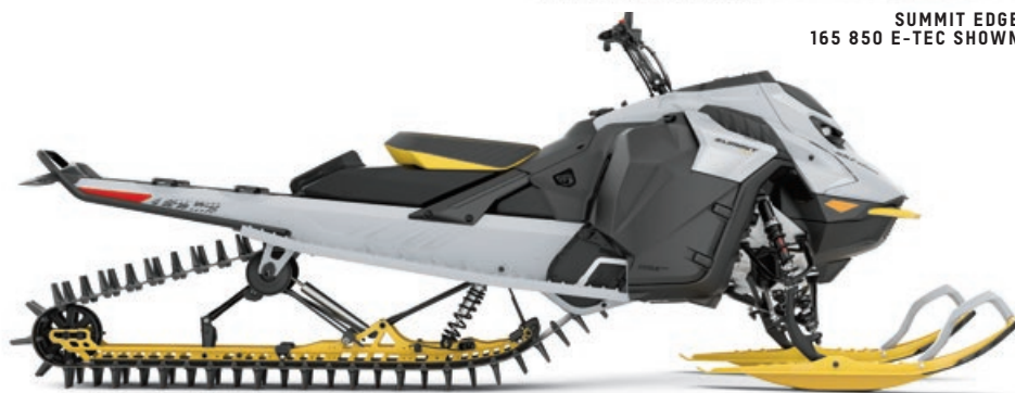
SUMMIT EDGE 165 850 E-TEC SHOWN