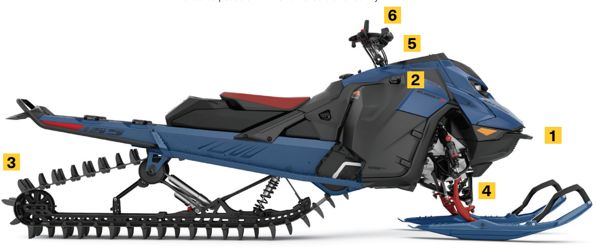
SUMMIT X WITH EXPERT PACKAGE 165 850 E-TEC TURBO R SHOWN

This lighter, redesigned 16-in. track unique to the Expert package, has a stiffer edge that compliments the fixed rear arm of the tMotion XT for more rigidity in the rear skid.