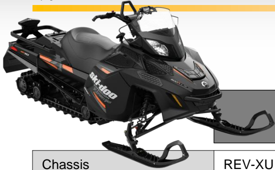
2018 Expedition Xtreme