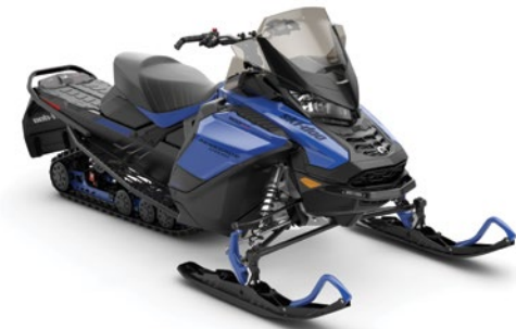
RENEGADE® ENDURO™ 900 ACE™ TURBO SHOWN