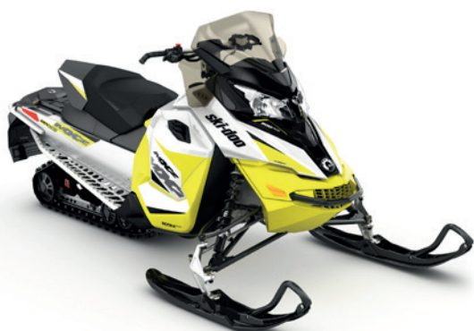
MXZ ® SPORT 600 ACE shown