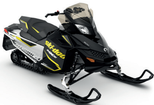
MXZ® SPORT 600 Carb shown