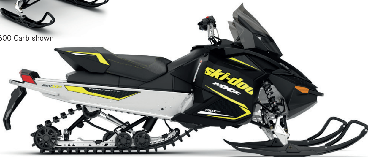
MXZ® SPORT 600 Carb shown