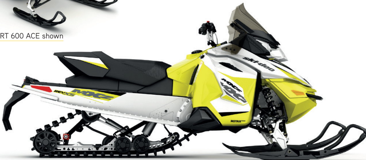
MXZ ® SPORT 600 ACE shown