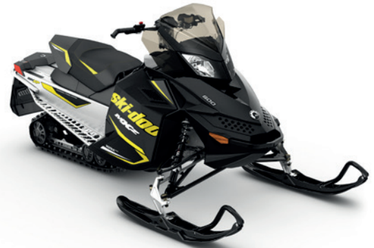
MXZ ® SPORT 600 Carb shown