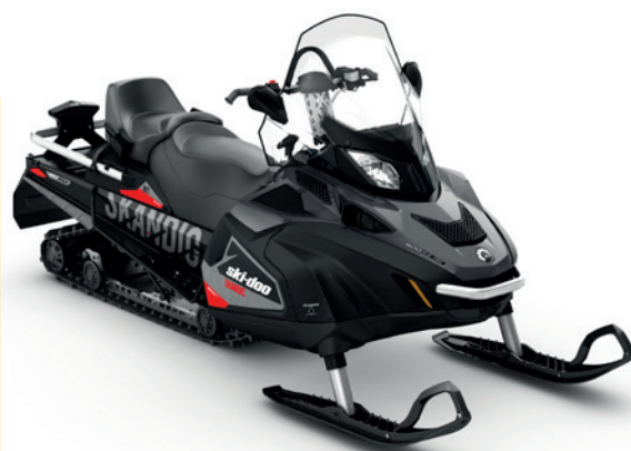
SKANDIC® WT 600 H.O. E-TEC® shown