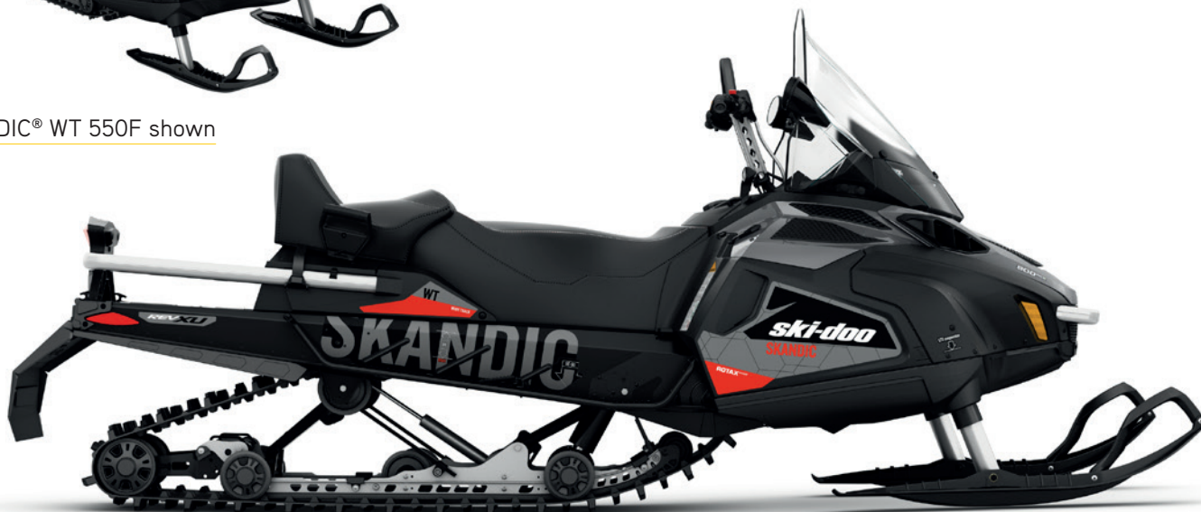
SKANDIC® WT 900 ACE shown