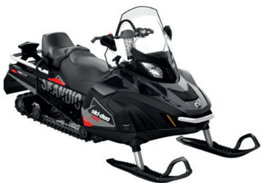
SKANDIC® WT 550F shown